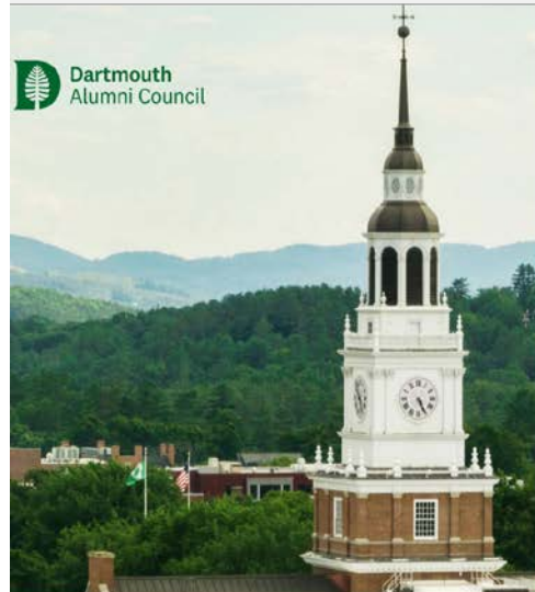
Alumni Liaison Committee 2021–2022 Annual Report to the Dartmouth College Board of Trustees