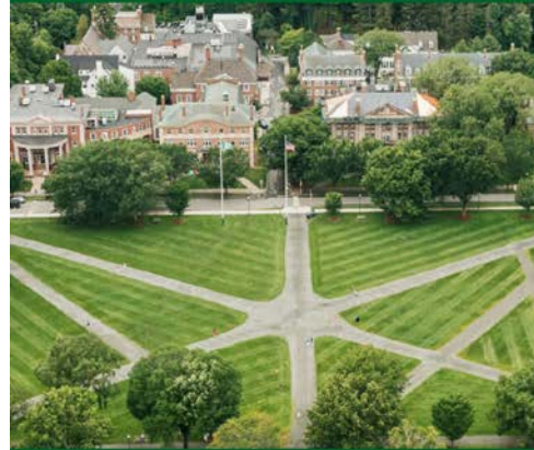
Alumni Liaison Committee 2020–2021 Annual Report to the Dartmouth College Board of Trustees

alumni.dartmouth.edu/committees/alumni-liaison